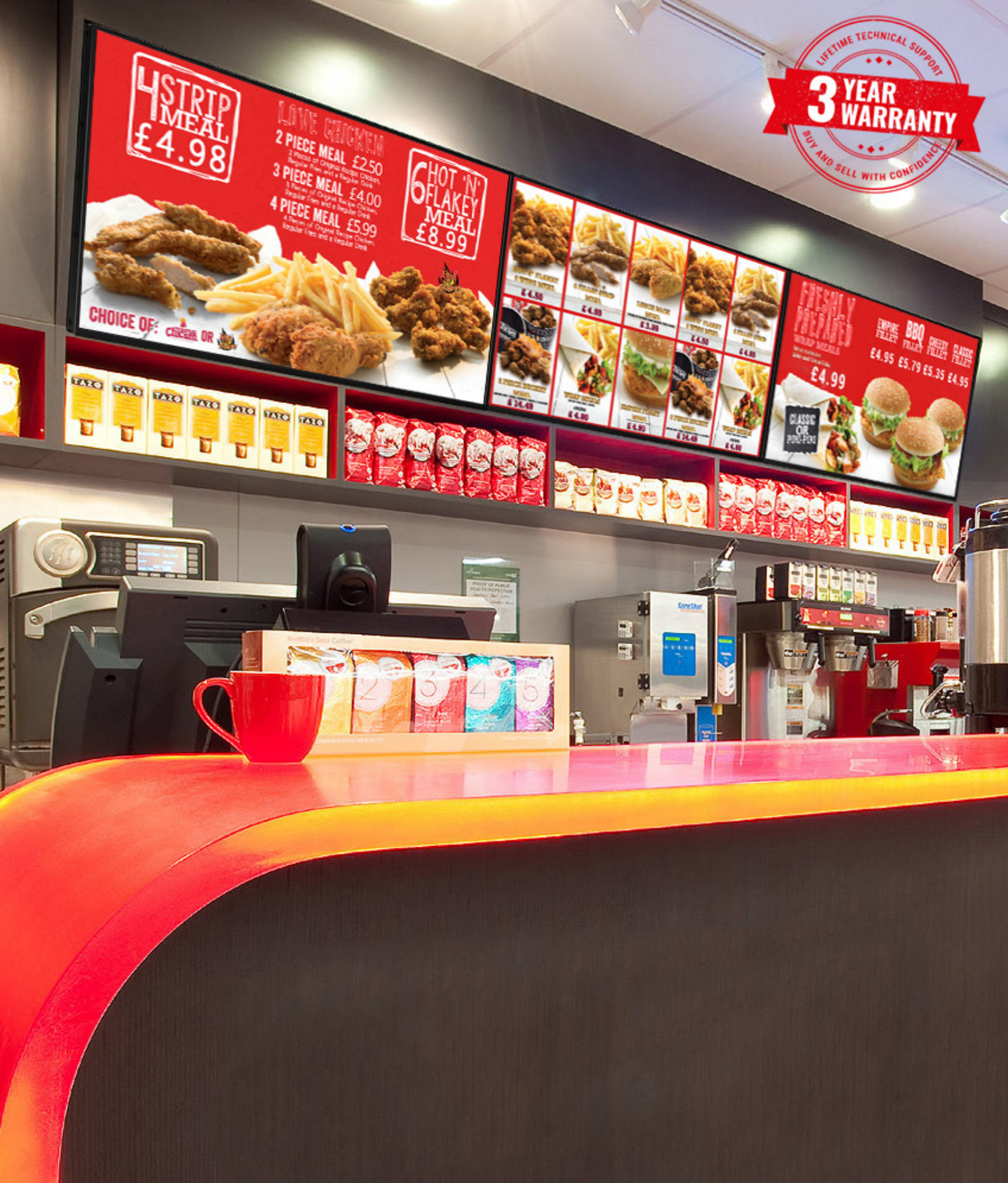
32" Network Digital Menu Board